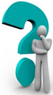
Illustration (Question) (Show if you can ask Jesus a question)

If You could ask Jesus a question, what would you ask?