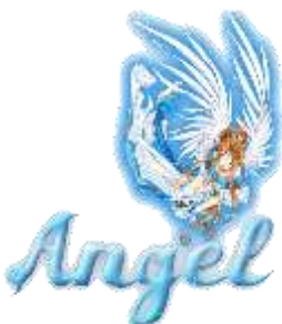
Illustration “Angel” (Show picture of Angel )

What does an angel look like – Tus Timtswv zoo li cas? Nej puas xav haistias, tus timtswv yog ibtug ntsujplig muaj tis, losyog ibtug txivneej losyog pojniam hnav tsootsho dawb? Vajluskub yeej qhia txog haistias cov timtswv yeej muaj tis. Tiamsis nyob rau Yexus tiam cov timtswv tshwm los zoo li tus txivneej hnav tej tsootsho dawb dawb rau ntau tus tibneeg pom. Cov menyuam yaus, “Did your parent ever say to you – nej niam thiab txiv puas tau hais rau nej haistias, “You’re an angel – Koj yog timtswv ”? Nej cov laus lawm, puas tseem muaj tibneeg hu koj haistias, “You’re an angel – Koj yog timtswv ”? Yog tsis muaj leejtwg hu koj li no lawm, vim lawv tsis nco thiab tsis paub