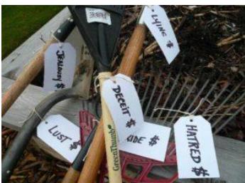
Illustration "discourage" (Show devil selling his tools)

The devil, according to an old story, once advertised his tools for sale. On the sale date, the devices were placed for public inspection, each marked with a price. It was a treacherous lot of implements hatred, envy, jealousy, deceit, lying, pride, etc. (Show devil discouragement tool)