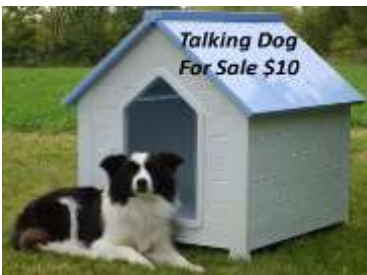
Illustration “Liar” (Show talking dog for sale)

A guy sees a sign in front of a house: “Talking Dog for Sale.” He rings the bell, and the owner tells him the dog is in the backyard. The guy goes into the backyard and sees a black mutt just sitting there. “You talk?” he asks. “Yep,” the mutt replies. “So, what’s your story?” The mutt looks up and says, “Well, I discovered my gift of talking pretty young, and I wanted to help the government. So, I told the CIA about my gift; in no time they had me jetting from country to country, sitting in rooms with spies and world leaders, because no one figured a dog would be eavesdropping. I was one of their most valuable spies eight years