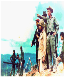
Illustration “Prepare” (Show picture of General Vang Pao)

Yaxayas 40:3 “A voice of one calling: “In the wilderness prepare the way for the Lord, make straight in the dessert a high way for our God – “Muaj lub suab qw hastas, ca le khu kev tog tug Tswv; khu kev kuas ncaaj tom tej taj suabpuam khu kev rua peb tug Vaajtswv.” Nuav yog Vaajtswv Txujlug. (Cross reference – Lukas 3:4, Mathais 3:3, Malakaus 1:3, Yauhas 1:23, Nkauj Qhuas Vajtswv 68:4, Yaxayas 11:16; 35:8; 40:4, Malakis 3:1; 4:5)