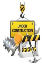
Illustration "Prepare" (Show Under Construction, Japan earthquake Kanto Road – Town Repair)

Lukas 3:4 , "As is written in the book of the words of Isaiah the prophet: "A voice of one calling in the desert, 'Prepare the way for the Lord, make straight paths for him – Qhov nuav muaj lawv le Yaxayas tug kws cev Vaajtswv lug sau tseg rua huv nwg phoo ntawv hastas, " Muaj ib tug has nrov nrov tom roob mojsab qhua hastas, 'Ca le khu kev tog tug Tswv, khu kev kuas ncaaj nwg yuav lug. " Nuav yog Vaajtswv Txujlug. (Cross-reference – Lukas 3:4, Mathais 3:3, Malakaus 1:3, Yauhas 1:23, Nkauj Qhuas Vajtswv 68:4, Yaxayas 11:16; 35:8; 40:4, Malakis 3:1; 4:5)