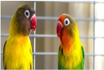
Illustration “prayer” (Show a pair of parrots)

Muaj ibtug xibhwb nws muaj ibtug noog “parrot – noog leebnkaub.” Tus noog no pheej haistias, “Let’s pray, let’s pray – cia li thov Vajtswv, cia li thov Vajtswv.” Tus xibhwb qhia kom tus noog hais lwm lolus los tus noog tsis kam hais kiag li. Xibhwb hnov hiastias nws tus txwjlaug muaj ibtus noog “parrot – noog leebnkaub” thiab. Tus txwjlaug no tus noog tsua haistias, “Let’s kiss. Let’s kiss – cia li sib nwj, cia li sib nwj.” Yog li ntawd tus xibhwb thiaj li caw kom tus txwjlaug no coj nws tus noog “parrot – noog leebnkaub” tuaj rau ntawm xibhwb