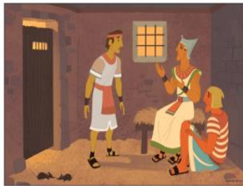
God was with Joseph. Genesis 39:2

Forgiveness is possible when we continue to trust that God will take care of us. Even after Joseph had been carted off to a foreign country, he believed that God was looking after him. Genesis 39:2 writes, "The Lord was with Joseph so that he prospered, and he lived in the house of his Egyptian master." In our Old Testament reading today, Joseph said, "... God sent me ahead of you to preserve for you a remnant on earth and to save your lives by a great deliverance." (Genesis 45:7). Joseph was able to forgive because he had not lost his faith. He trusted that God would provide no matter how badly he was hurt.