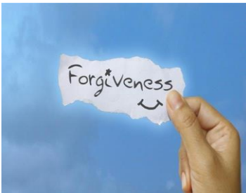
Illustration “Outlive” (Show forgiveness)

One Sunday a Preacher’s message was about forgiveness. Hoping to have made an impact, towards the end of the sermon, he asked his congregation, “How many of you have been able to forgive those who offended you?” About half held up their hands. Knowing he had more work to do, he preached another 20 minutes and asked again. This time all raised their hands except one elderly lady seated at the back. “Mrs. Jones?” inquired the preacher, “Are you not willing to forgive your enemies?” “I am ninety three years old now and don’t have a single one” she said. “Wow that is very unusual” said the Preacher and asked if she wouldn’t