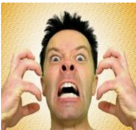
Illustration "Anger" (Show an angry face)

Muaj obtug phoojywg, nkawd hu ua Bill and Tom tuaj zaum haus coffee tham pem txog txojkev npaustaw. Bill hais rau Tom haistias, "Kuv yuav qhia rau koj saib tus tibneeg npautaws yog npau li cas."Thaum nkawd pib tham no yog 1 a.m. sawv ntxov. Bill nrho ib lub nyiaj mus hu xovtooj rau ibtus tibneeg. Thaum lub xovtooj nrov "ring, ring, ring ...."ob peb zaug lawm muaj ibtug txivneej teb tsaugzog tseemtsawv teb tias, "hello."Bill hais rau tus txivneej haistias "Kuv xav nrog Jones tham." Tus txivneej teb haistias "Tsis muaj leejtwg hu uas Jones nyob nov." (Click! – Khwb xovtooj)