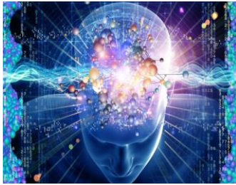
Illustration: (Dream) (Show what are your dream?)

Ua tibneeg nyob yam uas ua rau yus xav tsis thoob li yog txojkev npausuav. Ntau zaug yus ua npausuav ua rau yus ntshai, ceeb, txhawj losyog zoo siab rau yam uas yus ua npausuav ntawd. Yog koj ua npausuav zoo xws li yus yuav tau nyiajtxiag losyog tau zoo ccess thaum yus sawv mas ua rau yus zoo siab kawg nkaus vim yus xav ntsoov haistias yuav muaj tseeb li ntawd. Tiamsis yog yus ua npausuav phem, xws li ua tsheb sisnraus, poob qhovtsuas losyog lwmyam uas txaus ntshai mas thaum yus sawv mas yus tsua muaj txhawj mus tag li.