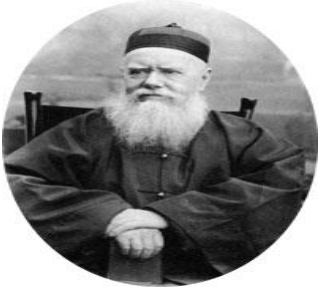
Illustration “Good name” (Show Hudson Taylor)

Ntev ntau lub xyoo dhau los ntawm cov nomtswv nyob rau suavteb kom ib tus tub sau ntawv xovxwm sau txog Hudson Taylor. Lawv lub homphiaj yog hais kom tus tub sau ntawv no sau txhuayam tsis zoo thiab muab Hudson lub npe hais kom puamtsuaj thiab ua kom nws poob ntsejmuag poob koob poob npe vim Hudson yog ib tug missionary qhia Txojmoozoo nyob rau suavteb. Tiamsis thaum tus tub sau ntawv no pib nrhiav txog Hudson lub neej thiab nws tej keebkwm, nws nrhiav tsis tau ib yam phem uas yuav sau txog Hudson li. Nws txawm nrhiav npaum li cas thiab yuav siv lub tswvyim twg los thuum kom tau Hudson los nws nrhiav tsis