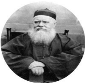
Illustration “Good name” (Show Hudson Taylor)

Ntev ntau lub xyoo dhau los ntawm cov nomtswv nyob rau suavteb kom ib tus tub sau ntawv xovxwm sau txog Hudson Taylor. Lawv lub homphiaj yog hais kom tus tub sau ntawv no sau txhuayam tsis zoo thiab muab Hudson lub npe hais kom puamtsuaj thiab ua kom nws poob ntsejmuag poob koob poob npe vim Hudson yog ib tug missionary qhia Txojmoozoo nyob rau suavteb. Tiamsis thaum tus tub sau ntawv no pib nrhiav txog Hudson lub neej thiab nws tej keebkwm, nws nrhiav tsis tau ib yam phem uas yuav sau txog Hudson li. Nws txawm nrhiav npaum li cas thiab yuav siv lub tswvyim twg los thuam kom tau Hudson los nws nrhiav tsis