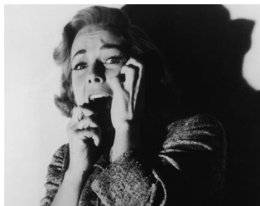
Illustration “Kinds of Fear” (Show Fear)

Mysophobia is “fear of dirt – ntshai av. ” Hydrophobia is “fear of water – ntshai dej. ” Nyclophobia is the “fear of darkness – ntshai tsau ntuj. ” Acrophobia is “fear of high places – ntshai chaw siab. ” Taxophobia is the “fear of being buried alive – ntshai faus cij. ” Xenophobia is “fear of strangers – ntshai tus tibneeg tsis paub. ” Necrophobia is “fear of the dead – ntshai cov uas tuag lawm. ” Claustrophobia is “fear of confined places – ntshai qhov chaw kaw. ” Triskaidekaphobia is “fear of the number 13 – ntshai tus lej 13. ” Tibneeg coob leej ntau tus ntshai ntau yam hauv ntiajteb no tiamsis tibneeg tsis paub ntshai