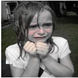
Illustration “Fear” (Show picture of children fear)

Cov researcher at Johns Hopkins University qhia xovxwm tias dhau li 30 xyoo los lawm, yam uas cov menyuam yaus nshai tshajplaws yog: 1) Animals - Tsiaj , 2) Being in a dark room – Nyob hauv chav tsausntuj nti , 3) High places – Qhovchaw siab , 4) Strangers – Tus tibneeg uas nws tsis paub , 5) Loud noises– Lub suab nrov . Tiam tamsimno, cov menyuam yaus ntshai tshajplaws yog: 1) Divorce – Kev sisnrauj , 2) Nuclear war – Kev ua rog , 3) Cancer – Mob cancer , 4) Pollution - Paspheem , 5) Being mugged – Raug lwmtus ntau losyog lwmtus ua phem . ( Back to the Bible Today, Summer, 1990, p. 5 )