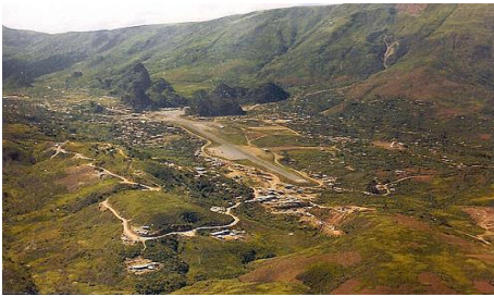
Illustration “Afraid of dying” (Show Longcheng air field)

Nyob rau tebchaw nplog nyablaj tuaj tua Loojceeb lub tshav dav hlau. Loojceeb yog lub zos uas siv xovtooj nrog cov tubrog tom tshav rog sibtham, xa mostxwv thiab khoom mus pab rau cov tubrog. Loojceeb yog ib lub zos uas cov yeebncuab tuaj txeeb nyuaj kawg nkaus vim nws muaj tej roob los thaiv puag ncig lub zos. Thaum cov “Communist Vietnamese – nyablaj liab” tuaj tua Loojceeb xyoo 1971, ( Show afraid )