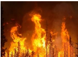
Illustration "Fire" (Show forest fire)

Thaum nej pom hluavtaws cig kub tej nyom, havzoo, losyog tej teb uas nej taw tsaus rau nws cig zoo li cas? Cia nej xav mentsi haistias yog ib cov havzoo qhuav qhuav es nws cia li pib kub nyiab lawm, nws yuav kub nyiab sai mus zoo li cas. Nws yuav cig hlob thiab tib pliag xwb nws yuav kub thob roob thob hav huv tibi puasyog. Nej yuav pom tej nplaimtaws yuav cig sai thiab yuav ua rau nej xav tsis thob haistias ua li cas nws yuav cig kub saib heev vim nplaimtaws kub nplaimtaws. (Show burning heart)