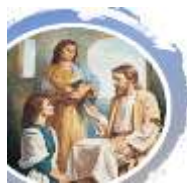
Luke 10:42 “... Mary has chosen what is better, and it will not be taken away from her. ” (NIV)

I. That’s why the words of Jesus in our Gospel Lesson today are especially comforting. (Show Luke 10:42)