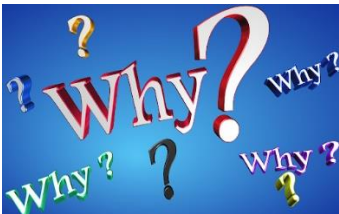
Illustration: “WHY?” (Show Why?)

Niahnub no peb xav paub lub ntsiablus haistias, “Why! - Yog vim li cas? ” Peb tej tub tej ntxhais poob mus koom nrog tej pab laib es cia li khiav lawm tsis mloog niam mloog txiv lus? Muaj ib khub niamtxiv hais tawm hauv TV haistias, “ Yog haistias, wb tus menyuum tuag los ntawm tsheb nraus ntshe tseem zoo tshaj li wb tus menyuum khiav mus ua laib lawm? ” Peb cov uas yog niam yog txiv, peb nyuajsiab heev rau tej kev tshwmsim li no, peb rov nug peb tus kheej haistias,