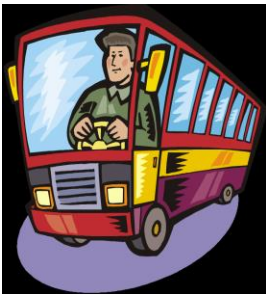
Illustration “How old” (Show picture bus driver and question 1)

You are driving a bus. You go east 12 miles, and turn south and go 2 miles and take on 9 passengers, and then you turn west and go 3 miles and let off 4 passengers. How old is the bus driver? – Koj tsaav ib lub npav. Koj moog rua saab nubtuaj le 12 miles kev, hab tig moog rua saab qaabteb hab tsaav moog li 2 miles kev ces koj tog 9 tug tuabneeg lug rua huv lub npav ces koj moog rua sab nubpoob hab moog le 3 mile kev ces tso 4 tug tuabneeg nqeg npav Lawm. Tug tsaav lub npav ntawd muaj pestsawg xyoo? Mej leejtwg teb tau hastas tug tsaav lub