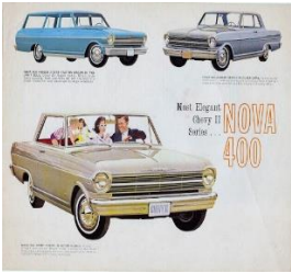
Illustration "Bright Star – Won't Go" (Picture of 1962 Chevy Nova)

Xyoo 1962 General Motors pib ua cov tsheb Chevy Nova. Lub tsheb no muaj ob losyog plaub lub qhovrooj. Lub tsheb no kuj tsis zoo zoo nkauj pestsawg tiamsis nws kuj yog ib lub tsheb uas ua rau tibneeg tsav tau yoojyim. Yov vim li cas GM thiaj li muab lub tsheb no tis npe hu ua "Nova." Lolus Asmesliskas "Nova" txhais haistias, "Bright Star." Lolus no yog lawv qiv ntawm cov txawj saib hnuqub – astronomy los vim lawv txhais haistias, lub hnuqub ci ntsa iab, ci mus li, thiab tsis txawj tuag. Tiamsis lolus "Nova" txhais rau haiv tibneeg Spanish yog txhais haistias, "Not go – Tsis mus. "