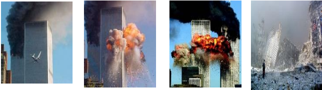
Illustration “Forgive - 9/11” (Show picture of 9/11 damages)

Nej puas nco hnuv September 11, 2001. Lub sijhawm ntawd nej ua dabtsi? Kuv nco ntsoov haistias, niam xibhwb wb tabtom sawv los qhib TV xyuas. Thaum wb pom tej xovxwm tshwm txog the World Trade Center raug puamtsuj, wb nqa ib lub TV me coj mus rau tom wb lub