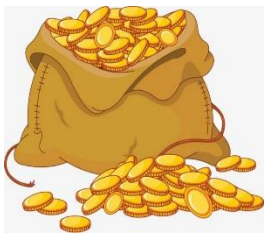
Illustration “Gold” (Show bag of money)

Muaj ibtus txivneej nqa ib hnab nyiajkub nrog nws caij ib lub nkoj. Lub hnabnyiaj no yog tagnrho nws lub neej. Tsis ntev muaj ib cov cua daj cua dub los raug lub nkoj ntawd, ces tus Captain hu kom txhuatus yuavtsum “abandon ship – dhia tawm ntawm lub nkoj vim lub nkoj yuav tog rau hauv havdej.” Tus txivneej no tsis xav tso nws cov nyiaj tseg, nws muab cov nyiaj los ua siv sia rau ntawm nws lub duav. Thaum nws sia tag lawm, nws dhia rau hauv dej. Nws tog mus rau hauv “qab dej hiavtxwv – bottom of the sea” thiab tuag. Nej sim ua tibzoo xav seb, nws tau cov nyiaj losyog cov nyiaj tau nws?