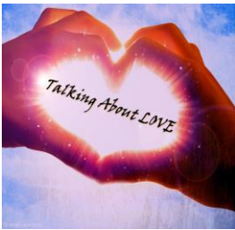
Illustration: “Love?” (Show talking about love?)

One of the Hmong men told me at a Valentine’s work shop that I was a guest speaker. He told me that he can’t say the word “I love you” to his wife. I asked him why? With a grin on his face, he then said, “Pastor, we Hmong men just don’t show affection by saying ‘I love you’ to our wife. We are shy. Since we have a full house of children then that is love.” He had a big smile on his face as he said it. You will notice that not many Asian men and women tend to show affectionist on public because expressing love to their spouse is different way than the caucasian do.