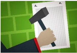
Illustration “No more school debt” (Show paid in full)